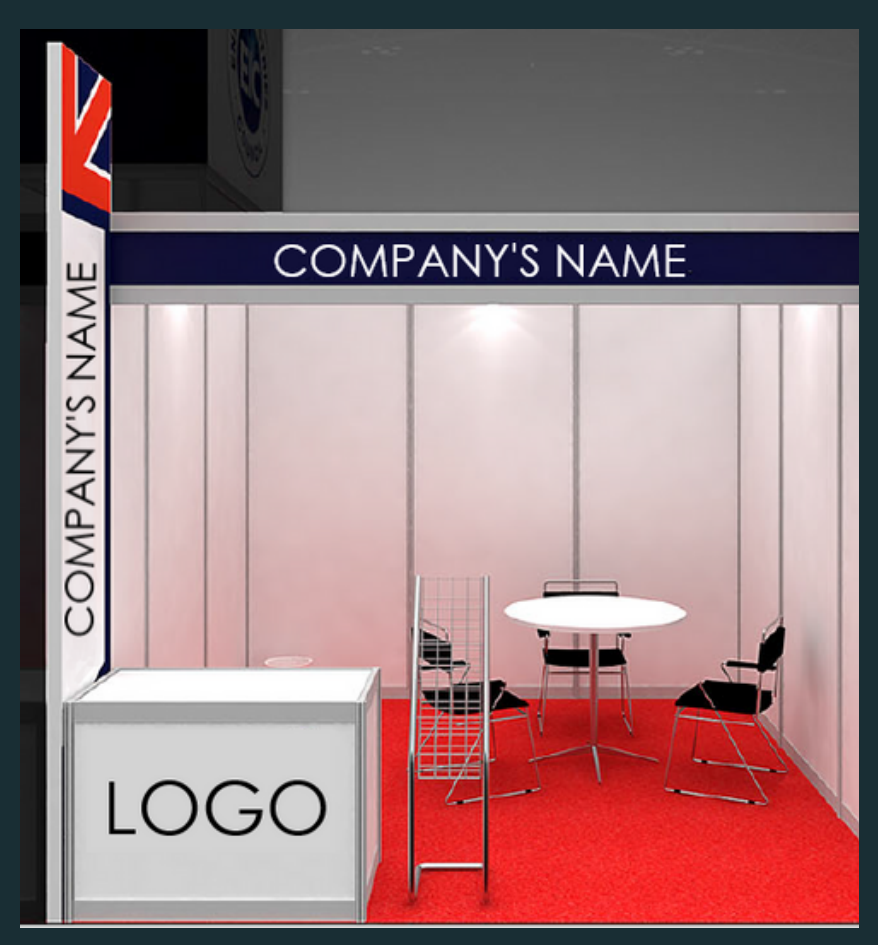
* Example image for display purposes only